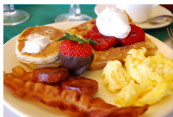
Brunch & Swap

Date: Monday, December 16th Time: 11:00AM Where: Recreation Room at Manor Details: If you haven't "fondued" before, you are in for a treat! There will be chicken, beef, shrimp, french bread, chocolate, fruit, cheese dip, and more!