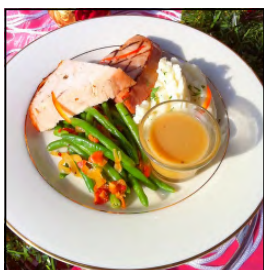
Dinner @ Cafeteria

Dates: Thursday, December 5th @ 12:45 Cost: Free for Easton Residents Where: Easton Elementary School Cafeteria Details: The Easton School Department and the wonderful cafeteria staff invite you for a Christmas meal.