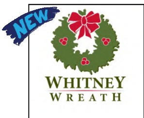
Lunch & Wreaths

Dates: Thursday, December 5th @ 12:45 Cost: Free for Easton Residents Where: Easton Elementary School Cafeteria Details: The Easton School Department and the wonderful cafeteria staff invite you for a Christmas meal.